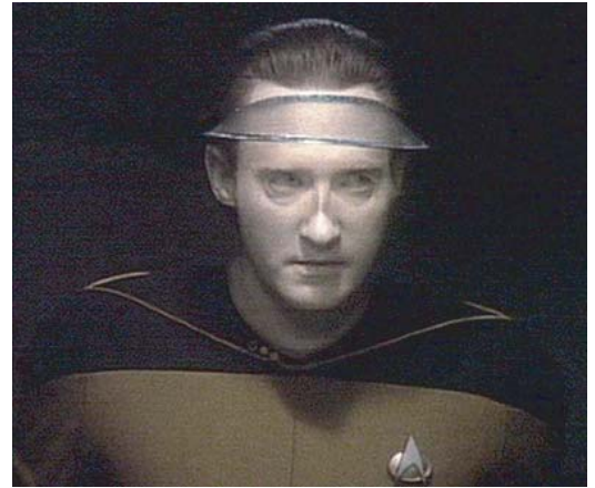
Beam me up to your Royal Flush

The great Kenny Rogers once sang, "You got to know when to hold 'em, know when to fold 'em, Know when to walk away and know when to run." So, me being the gambling novice I was, I tried to apply this logic to the final Stouffer poker tournament of last year. Sure, I've played poker before, online and in real life, but this was the first time with serious money on the line. So anyway, we're going around, I'm playing pretty conservative, trying to hang in as long as I can. The cards come my way and I decide to play this one (10, 9 Suited. Not a bad hand). Flop comes with a Queen and another card suited, plus another 9. All right, four in the flush, I go for it. Turn card is dealt as an Ace. All right, still have a chance at the flush so I stay in for the River card, hoping I can turn the flush. I was dealt a stab in the heart, a King of the wrong suit. But wait, I thought, I'm holding a 10 through Ace straight. Great hand, so I go all in, hoping to drag someone else in too. Player next to me decides to call. So here I am, laughing internally as everyone else folds. We show our cards and both of us claim the winning straight draw. Alas, both of us forgot what we were holding. Indeed, neither of us had the straight, but he had the high pair, Kings to 9s. My first actual gambling experience ends after only an hour as a smashing failure.