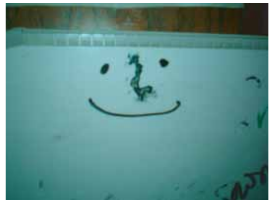
-----> Second Place "Happy Face" - Brian Barnett