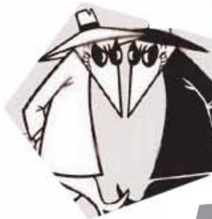
SPY VS. SPY